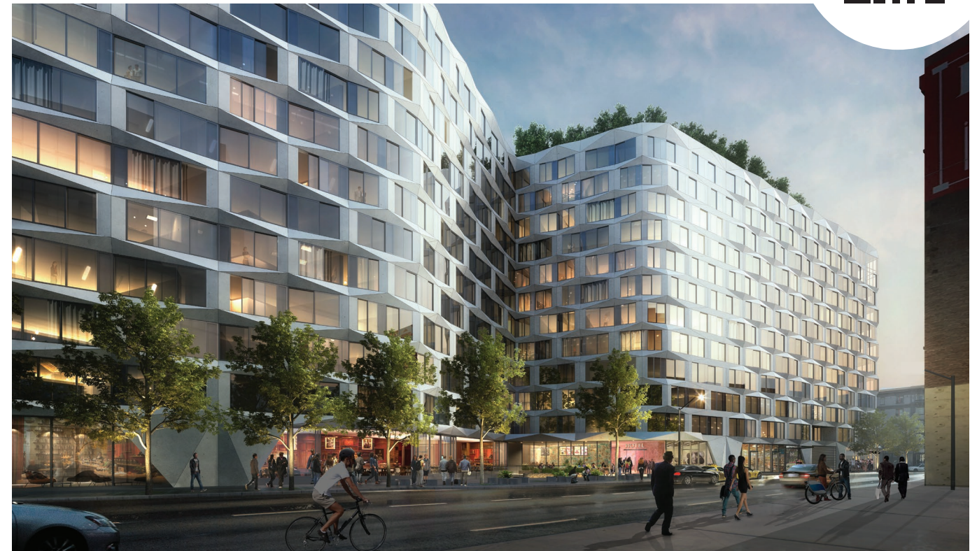
Clockwise from top: Heart of the City Farmers' Market (photo credit: Sergio Ruiz), Orpheum Theatre (photo credit: David Copper / Alamy), Serif & The Line Hotel (image credit: Handel Architects)