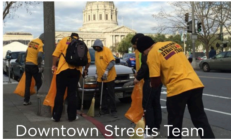
Downtown Streets Team