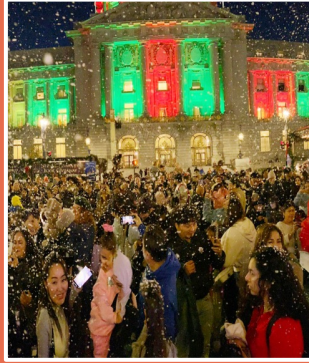
CCCBD hosts the annual Civic Center Tree Lighting event, a tradition for local families.