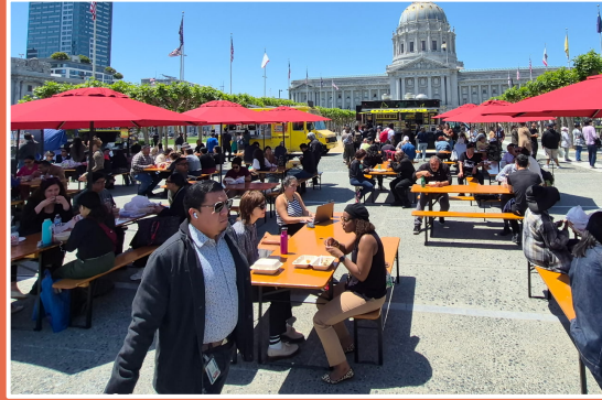
CCCBD ambassadors set up outdoor seating at the Heart of the City farmers' market, a popular lunchtime destination.