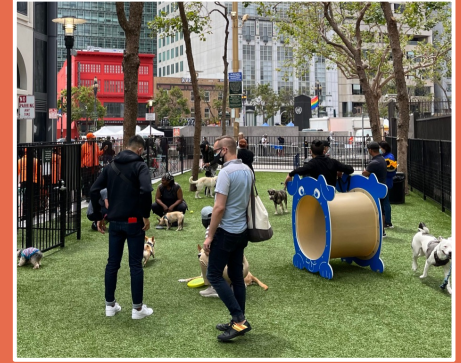
The UN Plaza dog park is a community gathering spot for neighborhood dog owners.