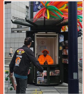
A former newspaper stand is repurposed as an information kiosk at Market and Grove Streets.