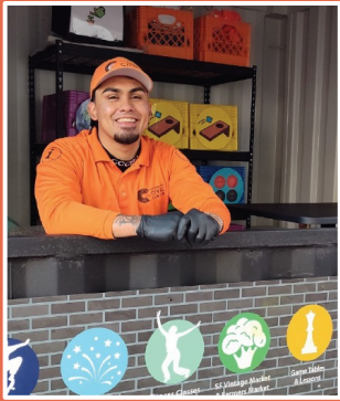
CCCBD ambassadors staff the UN Plaza 'Rec Shed' daily to lend games equipment and share programming information.

Civic Center Community Benefit District plays a vital role in managing and activating public spaces in the Civic Center community.