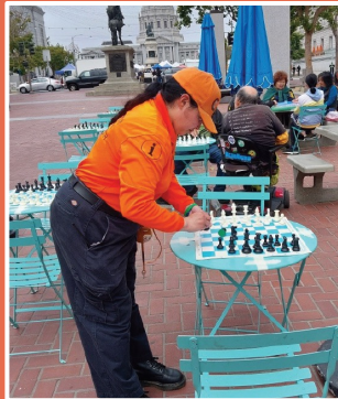
Free Sunday chess and mahjong classes are a programming mainstay in UN Plaza.