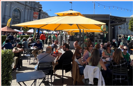
CCCBD supports the Limoncello café in Civic Center Plaza, by providing outdoor café furniture.